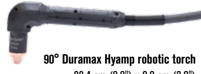
90° Duramax Hyamp robotic torch 22.4 cm (8.8") x 9.9 cm (3.9")