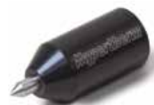
Teach tool kit*