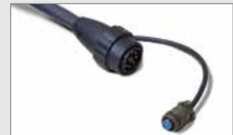
Mechanized torch lead with quick disconnect.