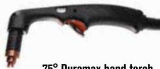
75° Duramax hand torch 9.9 cm (3.9") x 25.2 cm (9.9")

Compatible with Powermax65®, 85 and 105 systems.