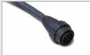
Handheld torch lead with quick disconnect.