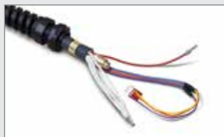
Handheld or mechanized torch lead without quick disconnect for Powermax600 CE systems.