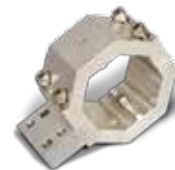
Clamp assembly kit