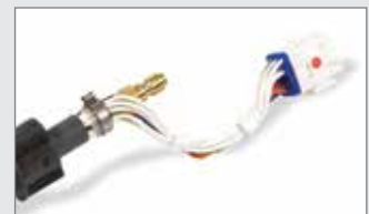
Easy Torch Removal (ETR) connection - makes Duramax retrofit torches easy plug-and-play upgrades