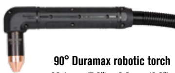
90° Duramax robotic torch 20.1 cm (7.9") x 9.9 cm (3.9")

The light weight, small size and built-in positioning features of Duramax and Duramax Hyamp robotic torches enable easy integration and operation with light robot arms. An optional clamp speeds integration.