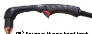
85° Duramax Hyamp hand torch 11.4 cm (4.5") x 31.2 cm (12.3")

Compatible with Powermax65, 85, 105 and 125 systems.